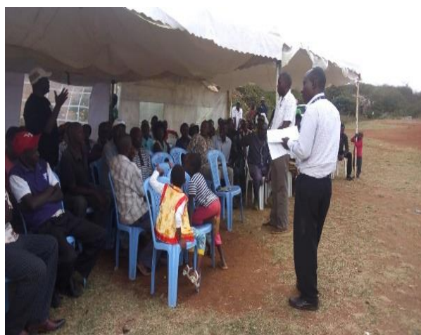
Plate 1: Stakeholders meeting at Njathaini