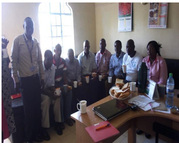
Plate 4: Stakeholders meeting at Kahawa West