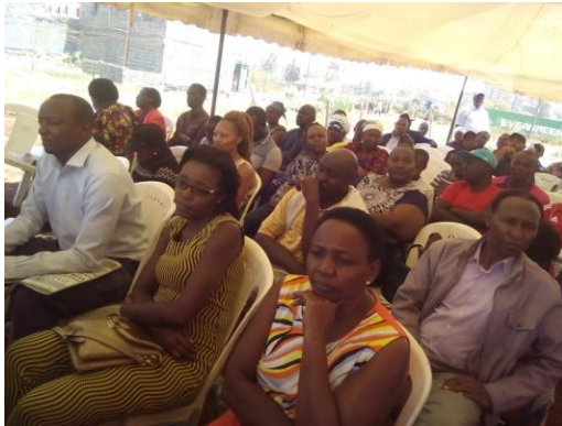
A Public Baraza in Ziman