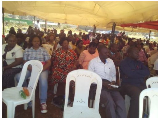
Baraza at AP post ground at Zimmerman