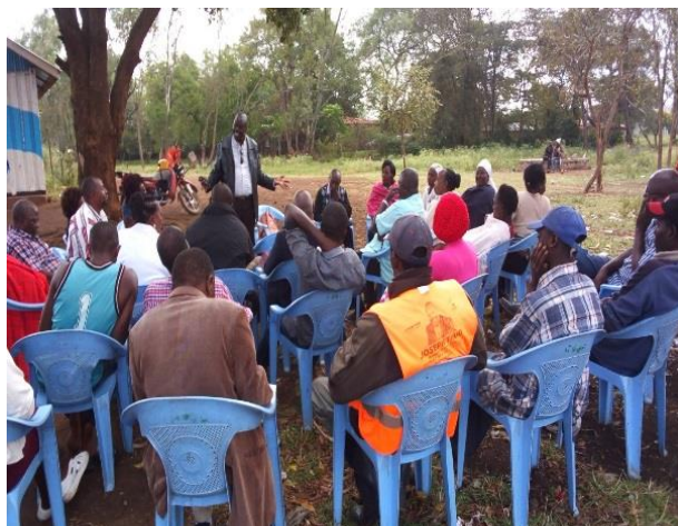
Plate 3: Stakeholders meeting at Githurai 44