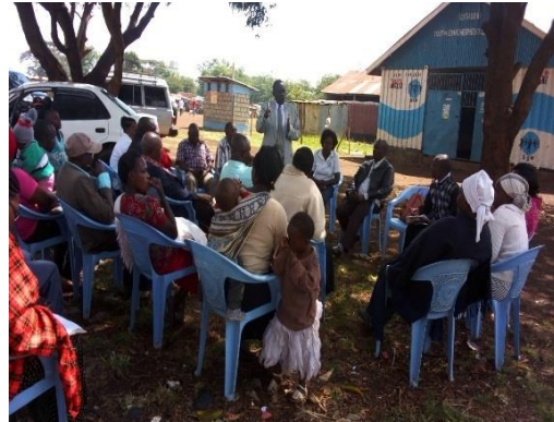
Stakeholders meeting at Githurai 44