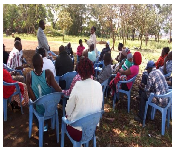
Plate 2: ESIA Team engaging landowners