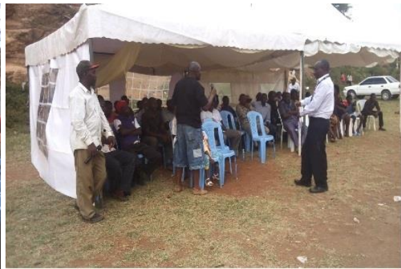
Stakeholders meeting at Njathaini