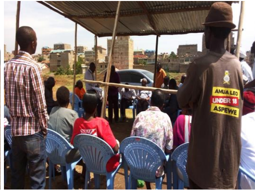
Stakeholders meetings at Kasarani