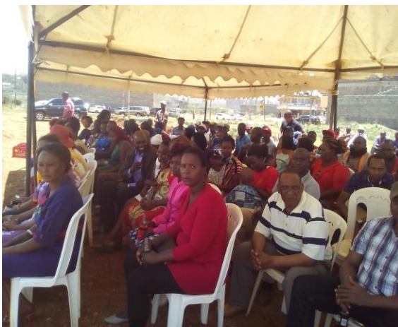
A section of participants at Zimmerman