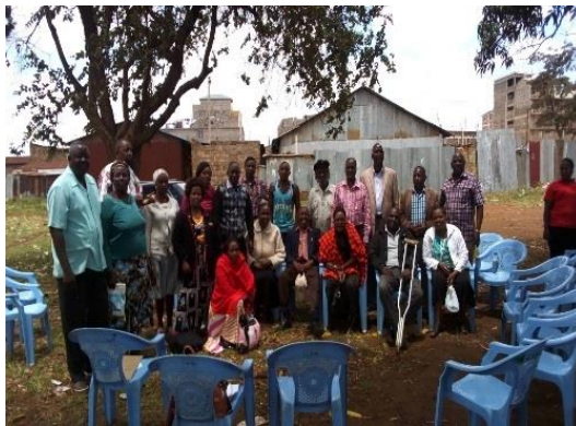
Consultation meeting at Githurai