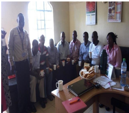
Land owners meeting at Kahawa west