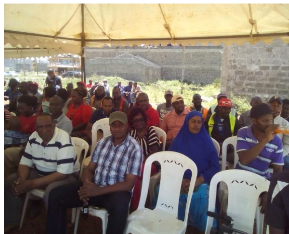
Plate 5: Stakeholders meeting at Ziman