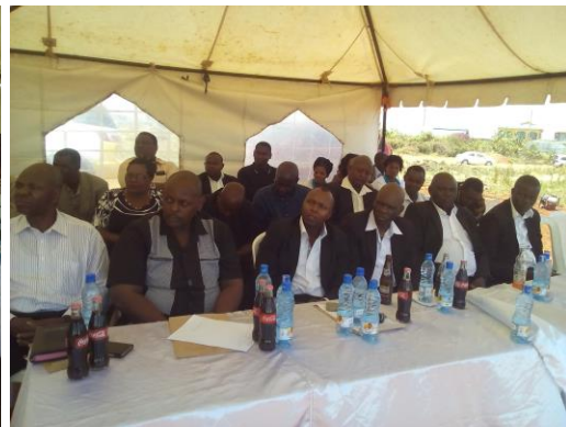
Ward Administrator addressing land owners at Zimmerman