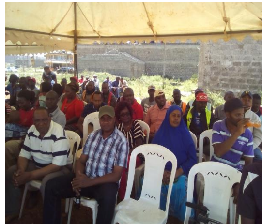
stakeholders' consultation meeting